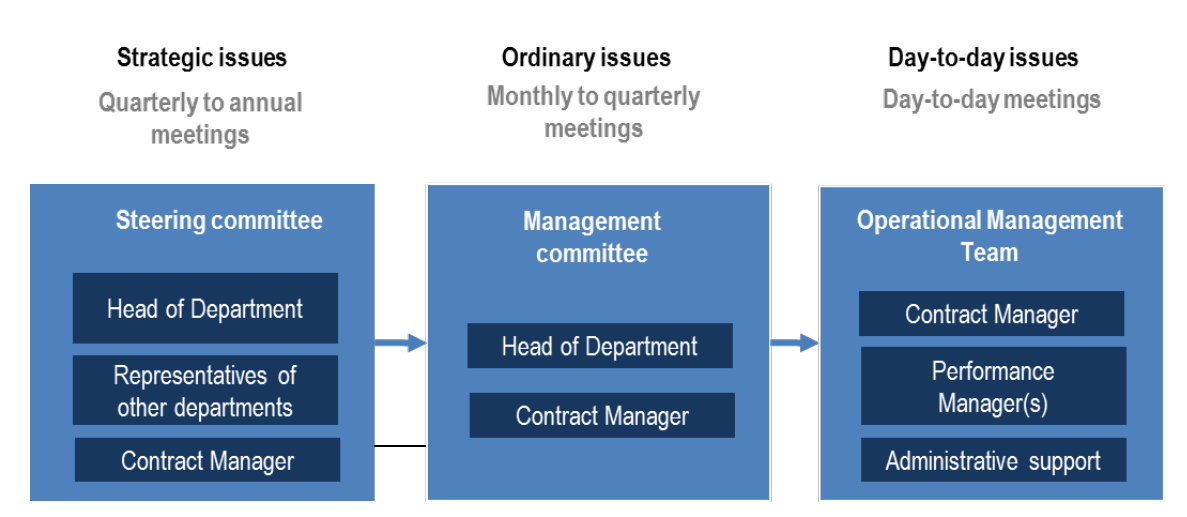
Figure 2 – Example of internal governance arrangements for the Authority

It is also important to establish interface at different hierarchical levels in order to (i) overcome any personal animosity that might arise between members of the Authority and private partner teams involved on a day-to-day basis and (ii) prevent the day-to-day "technical" relationship from being affected by possible conflicts at a more strategic level.